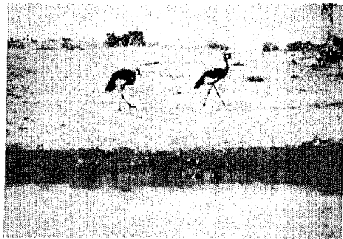
Crowned Cranes Balearica pavonina near Fingoun, Niger (see p. 79). (Photo: R.A. Cheke).