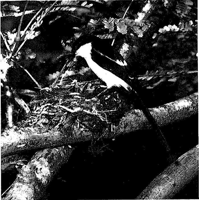
Fiscal Shrike - Pie-grièche fiscale - Lanius collaris