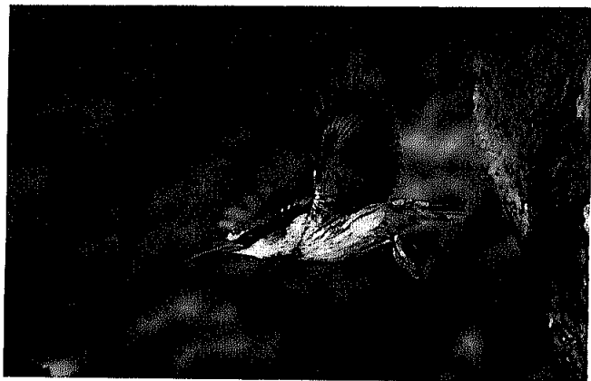
Striped Kingfisher - Martin-chasseur strié - Halcyon chelicuti

Striped Kingfisher Halcyon chelicuti . One record; single at Yekepa, Nov 1988. (AfM/NB, V (*))