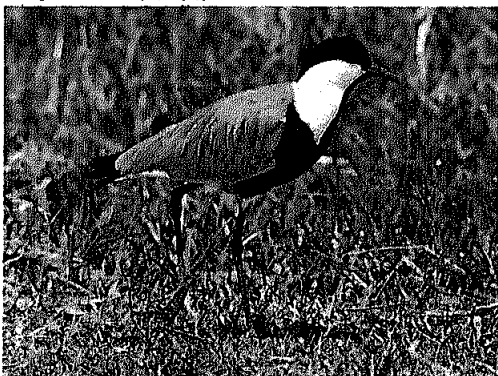
Spur-winged Plover - Vanneau éperonné - Vanellus spinosus

Spur-winged Plover Vanellus spinosus . One on a sand spit in Monrovia Port, 26 Dec 1988 to early Mar 1989. (V, r (*))