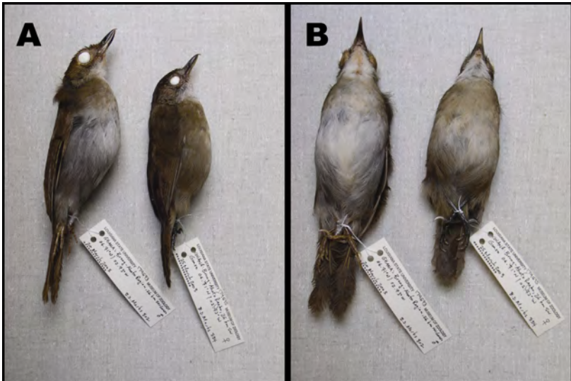
Figure 3. (A) lateral and (B) ventral views of Illadopsis rufescens (left, LSUMZ 174693) and I. rufipennis (right, LSUMZ 174695).