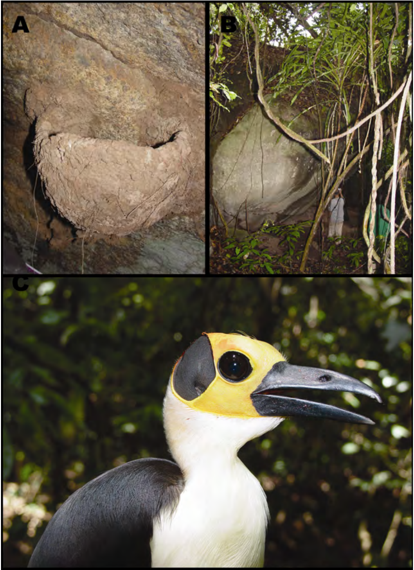
Figure 4. (A) one of two Picathartes gymnocephalus nests at (B) the overhanging boulder nest site, 30 Mar 2003; (C) a Picathartes gymnocephalus mist-netted and released on 26 Mar 2003.